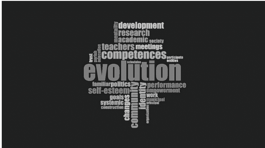
Figure 3 Word cloud of the focal group – model a.