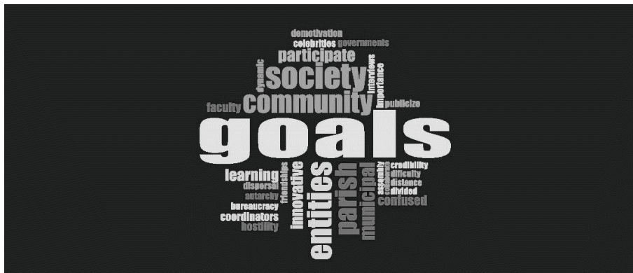
Figure 1 Word cloud of the individual interviews – model a.