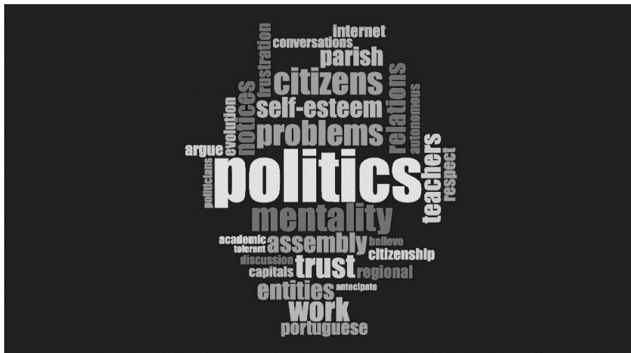
Figure 4 Word cloud of the focal group – model b.

opportunities; presentations, principal, discussion – threats, in model a); and b) the terms: self-esteem, communicate, respect – development of the person; politics, difference, confidence – development of individual action; politics, Assembly, Parish Council - social support; argue, upset, political – family; academic, conversations, frustration - school; implement, intention, negative – community.