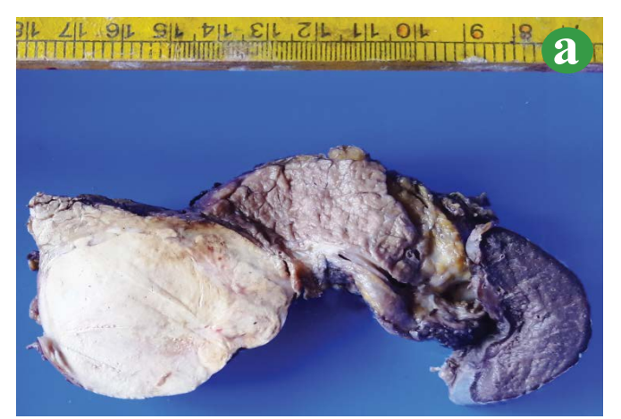
Figure 2a. Well circumscribed mass in proximal part of pancreas with yellowish white cut surface. Adjacent pancreatic parenchyma is unremarkable.