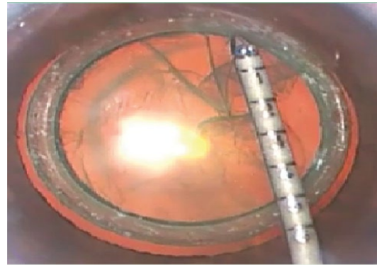
Figure 1 The anterior chamber refilled with dispersive OVD.

The Verus ring appears to be a useful device in performing safe and efficient capsulorhexis in patients with corneal scars undergoing cataract surgery. It is also a useful device for physicians under training and residents as it adds safety and centration and perfect sizing. We suggest using Verus ring in cases of mild to moderate corneal scars.