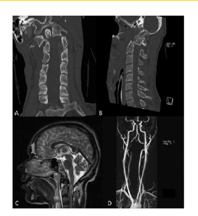
Figure 1: CT scan (A, B) of the cervical spine showing the posterolateral atlantoaxial subluxation with type II odontoid fracture. The MRI showed edema of the spinal cord with haemorrhages on the level of C1 to C3 (C). MRA of the cervical vessels displayed compression of the right vertebral artery (D).

The indication for immediate dorsal occipitocervical stabilization based on considerable atlantoaxial dislocation was defined, because the fracture was very unstable and a halo or other more immediate fixation would not suffice.