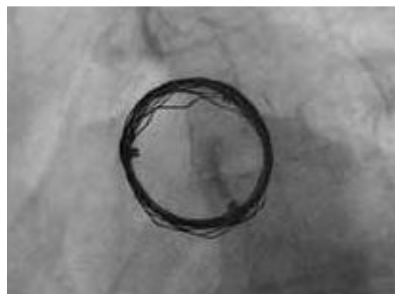
Figure 3: Barrel view showing optimal landing zone

In general, coronary vessels at risk are detected by simultaneous coronary angiography and inflation of a large non-compliant balloon in the RVOT. The balloon size should be large enough to cause complete abolition of systemic pressure after inflation. This will ensure adequate simulation of the external RVOT and pulmonary artery dimensions after percutaneous repair. Pre-stenting the RVOT with covered or open cell stents is recommended in all patients to improve the landing zone of the trans-catheter valve and to minimize residual gradients [13]. The stent formed "conduit" needs to be circular to enable optimal acute and longterm function of the implanted valve as leaflet coaptation could be impaired by non-circular deployment. A 'down the barrel' view is ideal to visualize the anatomy ( Figure 3 ).