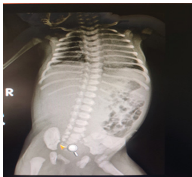
Figure 2 X-Ray of abdomen taken on day 1 of life.