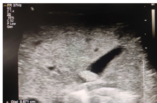
Figure 3 USG of abdomen taken on day 1 of life.

evoke a suspicion of ovarian cyst, while a thick wall cyst with bowel dilatation, then mesenteric cyst suspected. Any suspected ovarian cyst with hemorrhage points towards ovarian torsion, hence was diagnosed to be a hemorrhagic ovarian cyst with suspicion of torsion.