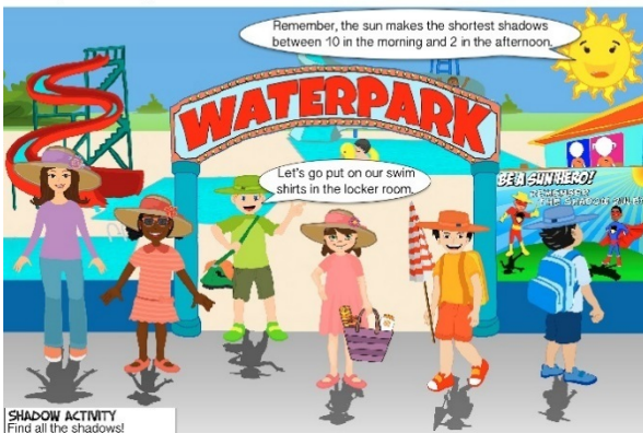
Figure 3 The shadow rule is able to be used by children who cannot tell time.

"Remember, the shadow rule: If your shadow is shorter than you are, go into the shade. If you are outside when the sun is strong, be sure to wear your sun gear," said Mom.