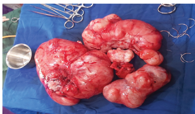
Figure 3 The myomas after inoculation; three more intramural smaller myomas were identified deep in the myometrium.

a base ball stitch using catgut number-0. After checking for hemostasis and correct count reported, we closed the abdomen. The estimated blood loss was around 600 ml. The patient left OR with stable vital sign and bedside ultrasound at recovery room