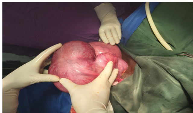
Figure 1 The biggest sub serous myoma (as seen from the right side); which has pulled the right fallopian tube upwards and extends to broad ligament on that side (Between surgeons hands).

Myomectomy was performed at 8 weeks of gestation via mid line abdominal incision. Upon entry into the abdomen, we found multiple myomas. There is a biggest sub serous myoma which has pulled the right tube upwards and extends to broad ligament on that side ( Figure 1 ). Another bigger intramural myoma on the left side around the anterior isthmus ( Figure 2 ). The uterus appears to have been pushed backwards and three more intramural smaller myomas were identified deep in the myometrium ( Figure 3 ). The surface overlying the mass is congested and was highly vascular. We applied triple tourniquet by passing number 10 Foley catheter through avascular part of broad ligaments and securing a tight knot as down on the cervix as possible anteriorly. To address blood supply from the ovarian vessels, we clumped both infundibulopelvic ligaments with soft intestinal clumps ( Figure 4 ). Then we made a single longitudinal incision on top of the mass and we managed to inoculate all the fibroids via this incision. We managed to avoid entry into endometrium. We closed the dead space with intermittent mattress and figure of eight stitches using vicryl number-0. We closed the myometrium in three layers using the same stitches and we released the infundibulo pelvic clamps after 30 minutes and the cervical tourniquet after 35 minutes. We secured bleeding from the cut serosa and closed it by applying