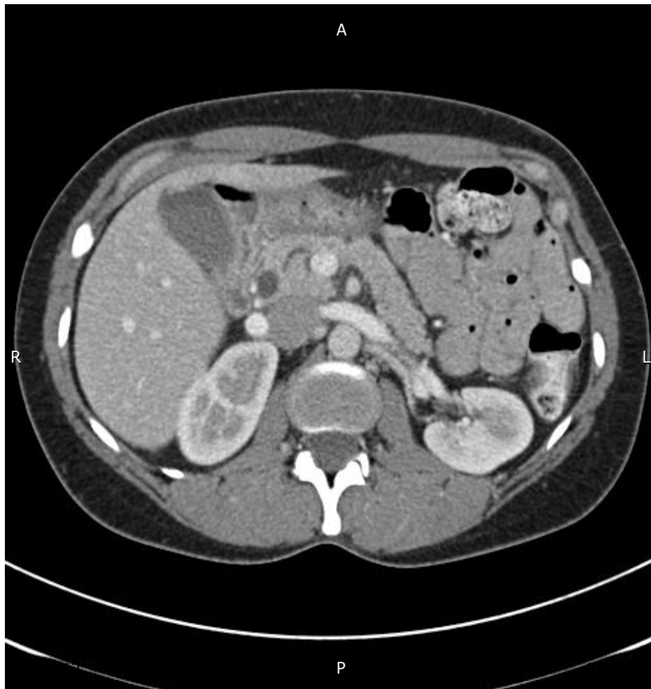
Figure 2. Post EUS-FNA CT showing – cyst without wall disruption and normal pancreas.