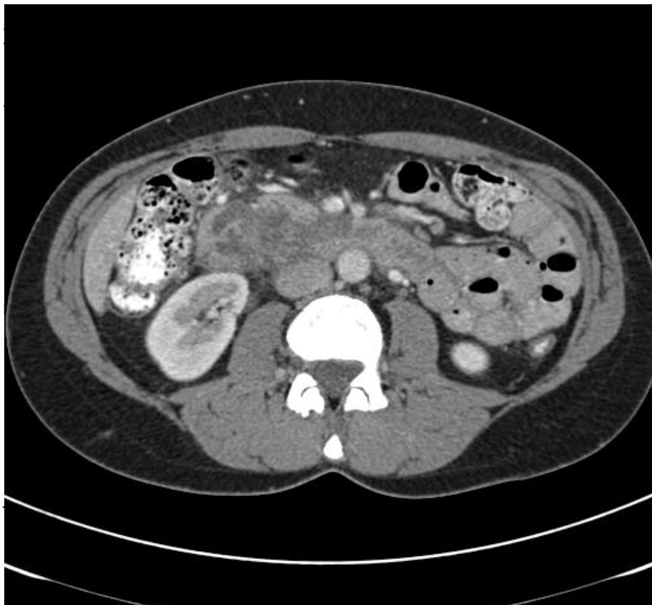
Figure 3. Post EUS-FNA CT showing inflammation of distal duodenum.