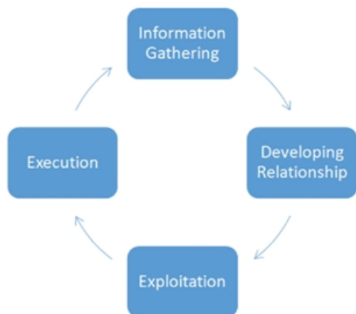
Figure 1: Attack cycle of social engineering.

Before launching an attack, attackers prepare their flow and identify a target during the information-gathering phase, also known as foot printing. The first phase includes more than just gathering information about the target; instead, it gathers additional (physical) attributes needed for the subsequent phases of the attack, such as recreating official document letterheads or learning target-related jargon and lingo. Different methods can be utilized by an aggressor to accumulate data about their objective. After this information has been gathered, it can be used to establish a relationship with the target or an important person, which can help ensure a successful attack (Figure 1). These might include disclosing information that, from a security standpoint, appears to be harmless but could be useful to the attacker. Public sources like web pages, social media posts, phone books, and job portals, among others, can be used to gather information, as can previous social engineering attacks. The information from this step is used to build a relationship with the people who are being targeted [7].