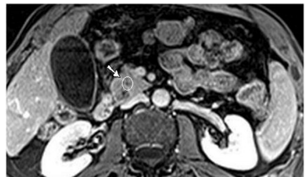
Figure 3. T1-weighted fast-field echo short-time inversion recovery (FFE STIR) post-contrast image shows a solid lesion with inhomogeneous late-phase enhancement (at the level of the intra-pancreatic biliary tract); moreover, MRI demonstrates mild enlargement diffusely involving the head of the pancreas associated with inhomogeneous signal intensity of the pancreatic tissue due to the presence of a hypointense nodule (arrow).

contrast medium, the lesion did not show significant enhancement in the arterial phase; however, late-phase images showed non-homogeneous enhancement (Figure 3). There was no evidence of positive lymph nodes or metastatic disease; the characteristics of the MR images were suggestive of a malignant primary stenosis probably by extra-hepatic cholangiocarcinoma. Furthermore, MR views demonstrated mild enlargement of the pancreas associated with a non-homogeneous signal intensity of the pancreatic tissue