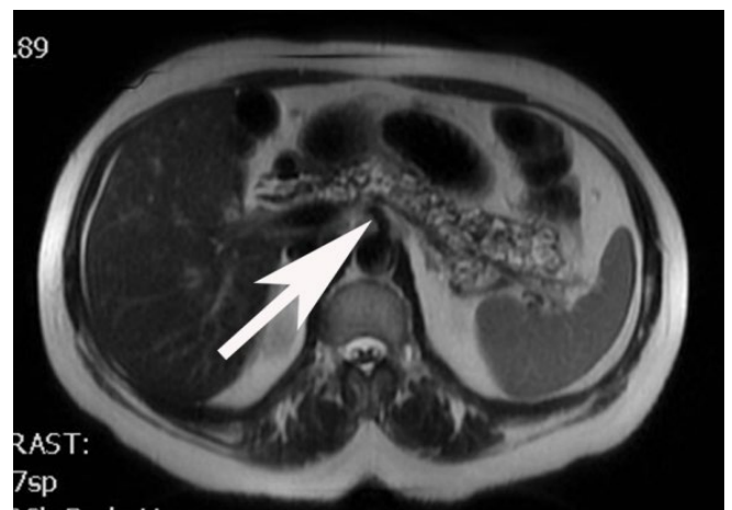
Figure 1. Axial T2-weighted MR image showed multiple simple cysts with size <1 cm

the ill is registered, while up to 20% of them arise from de novo mutations [2]. VHL disease shows a broad spectrum of associated conditions like hemangioblastomas of the brain, spinal cord and retina, endolymphatic sac tumors, pheochromocytoma and paraganglioma, renal cysts and renal cell carcinomas (RCCs), pancreatic cysts and neuroendocrine tumors, and endolymphatic sac tumors [2, 3]. Pancreatic manifestations alone may be present in about 7.6% of patients [4] and may include three types of lesions: simple cysts,