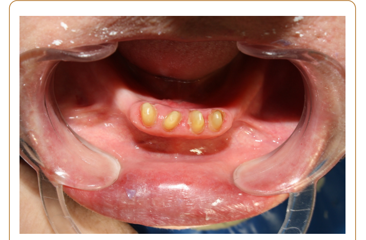
Figure 4 Occlusal view of teeth preparation.