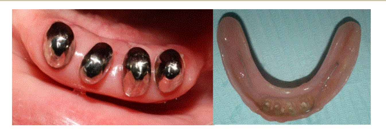
Figure 6 Occlusal view, metal copings cemented (left). The adjusted interim overdenture (right).

Cementation of the long metal copings: The metal coping was tried on the teeth and cemented permanently using Poly F cement (Dentsply, Germany). Subsequently, the intaglio surface of the interim overdenture was adjusted to remove any interference with the cemented copings (Figure 6).