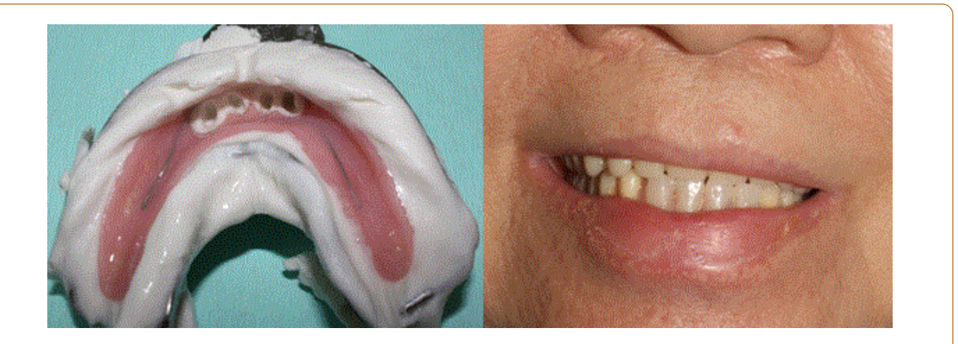
Figure 5 Current RPD was picked up with an alginate impression (left), the interim overdenture in place(right).

Construction of an interim overdenture using the existing lower prosthesis: The current lower removable partial denture was picked up with an alginate impression (Figure 5), and poured in stone, to modify it into interim overdenture by adding artificial acrylic teeth to it. And it was issued to the patient on the same day of the teeth preparation (Figure 6).