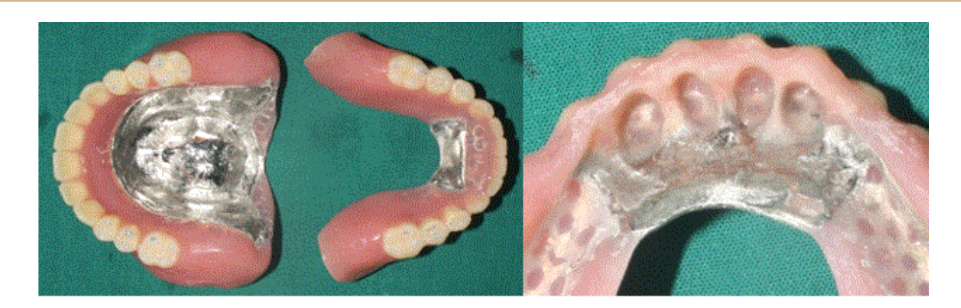
Figure 8 The finished prostheses (left) The intaglio surface of the lower overdenture (right).