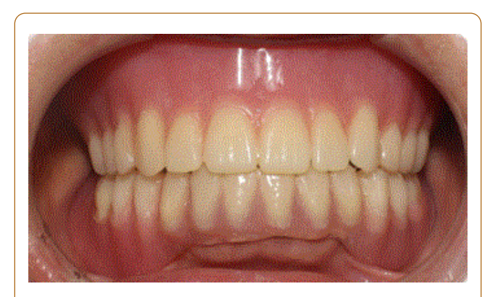
Figure 7 Denture at insertion stage.

Issuing the final prostheses: The conventional way of the metal reinforced removable prostheses construction and fabrication was followed. At insertion stage, the intaglio surface of the mandibular overdenture around the abutments was relined using side-chair hard relining material (KOOLINERTM Hard Denture Reline Material, GC, USA) to increase the intimate contact between the prostheses and the abutments (Figures 7 and 8).