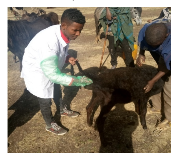
Figure 2: Faecal sample collection directly from the rectum.

glove itself after it was turned the inside out until reached to the laboratory as soon as possible and each sampled was process by modified Baermann technique. During sample collection age, gender, breed, body condition, management system and origin were properly record. Each bottle or glove containing the sample were properly labelled corresponding to the animal identity.