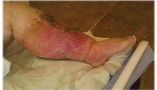
Figure 3 Pictorial representation of Patient A's healthy left limb.

transferase, alkaline phosphatase, lactate dehydrogenase) and six substrates (total protein, albumin, glucose, cholesterol, urea, creatinine) in blood serum [15].