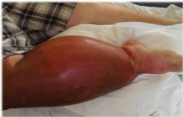
Figure 1 Effected erythematous-bullous erysipelas of Patient A's right lower leg.

To describe metabolic changes, we used "biochemical passport", the basis of which amounted to six enzymes (aspartate aminotransferase, alanine aminotransferase, creatine phosphokinase, gamma-glutamyl