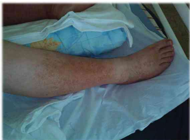
Figure 2 Pictorial representation of significant edema and lymphostasis of the affected lower limb.