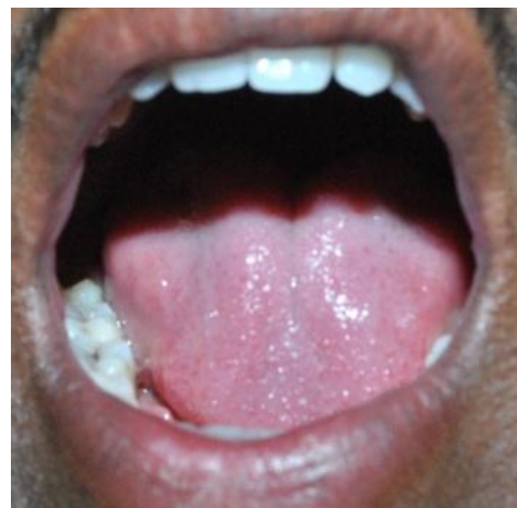
Male-I: After 72 hrs of Application