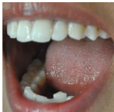
Female: After 72 hrs of Application