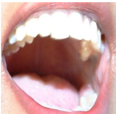
Female: Before Application