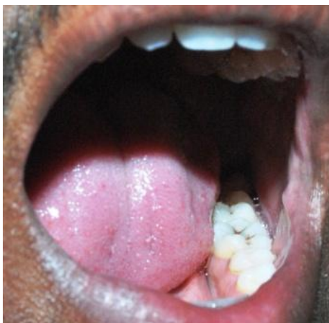
Male-I: Before Application