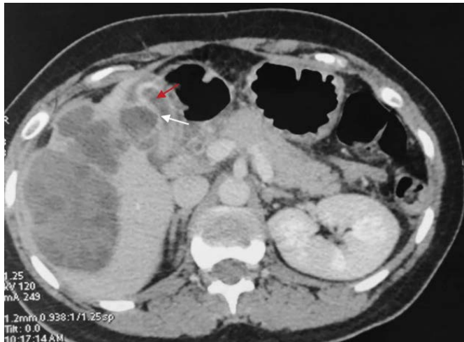
Figure 1. Coronal abdominal CT-scan picture showing a multi-located hepatic cyst lesion with many endogenous daughter cysts and exogenous daughter cysts adhering to the gallbladder (white arrow). Presence of daughter cysts in the gallbladder lumen (red arrow).