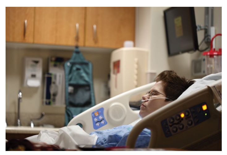
Figure 3 The geographical distance between the donor and recipient by using Database.