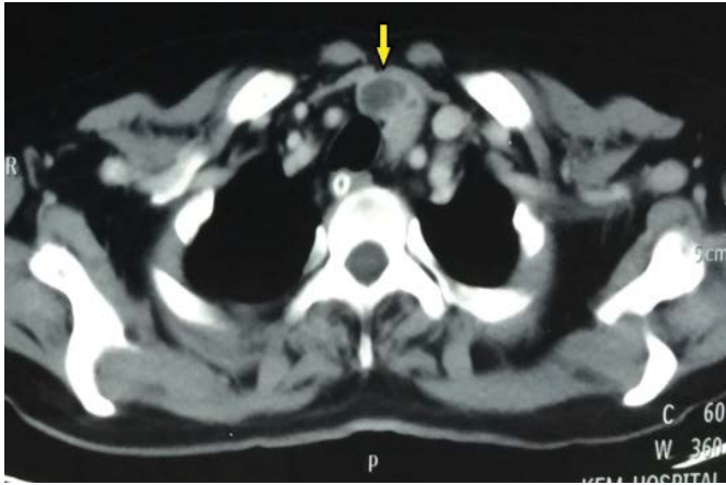
Figure 1. CECT showing left inferior parathyroid adenoma (yellow arrow).