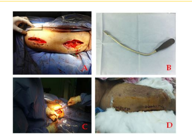
Figure 2: (A) Surgical incisions. (B) Tunnelling instrument. (C) Screws insertion. (D) Post-operative wounds.

Clinical and radiological assessments were performed at 6 weeks and every 6 weeks until complete healing of the fractures (12 week, 18 week, 24 week, 30 week, and 36 week).