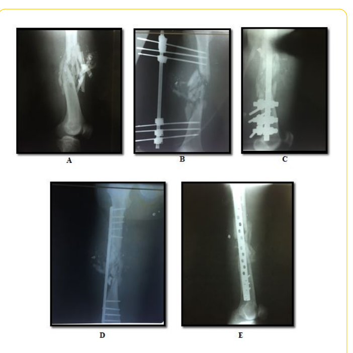
Figure 1: Patient number seven. (A) Type IIIA right side femoral shaft fracture caused by high velocity bullet. (B) AP plain radiogragh of the fractured femur 24 h post injury. (C) Lateral radiogragh 24 h post injury. (D) AP plain radiogragh after 14 days. (E) Lateral radiogragh after 14 days.

Removal of the external fixators and one-stage conversion procedure to internal fixation by MIPO technique with DCP was performed for all patients within 2 weeks; averaged 10.93 days (range, 7 to 14 days) (Table 1 and Figures 1 and 2).