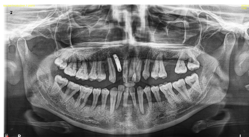
Figure 4 After two months follow-up post-operative orthopantomogram (OPG) showing improvement in bone regeneration.