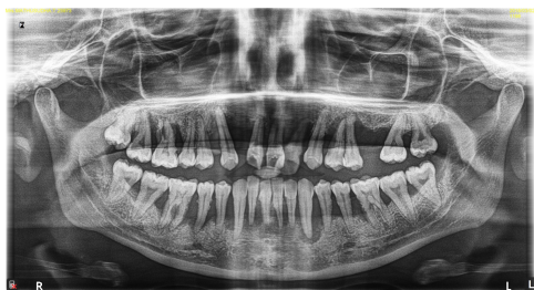
Figure 2 Orthopantomogram (OPG) shows the generalized horizontal bone loss of all teeth.

To control the progression of disease, patient was put on antibiotics (antibiotic regimen—Amoxicillin 500 mg (1-0-1), metronidazole 200 mg (1-0-1) for 4 days). Follow ups were