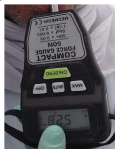
Figure 3 Digital Forcemeter.

After another two months the same patient received two stud attachments, two short metal copings were removed, the preparation for the stud attachment was as the same preparation as short copings with dowels. A plastic-threaded stud of size about 3 mm was attached to each waxed dowel copings. Both studs were made parallel to each other using a dental surveyor, waxed dowel coping and the stud assembly was casted in cobalt-cromium metal base ( Figure 6 ) and tried-in patient mouth, two stud attachments were tried in the patient mouth, cemented by permanent cement. As with the short copings, two MOD were relieved about 1 mm in the two housings and checked to ensure complete passivity; the retention element (matrix) is an integral part of a soft liner of an ordinary acryl denture. A self-cure silicone-based soft liner was placed in the two housings as a retentive female unit instead of plastic female caps, [15] the patient was asked to close in its centric occlusion until the soft liner was set,