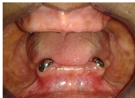
Figure 5 Intra- oral view of the two metal dome-shaped copies (subgroup 2).