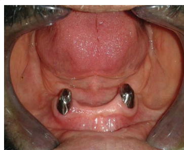
Figure 2 Intra-oral view of the long metal copings after temporary cementation (subgroup 1).