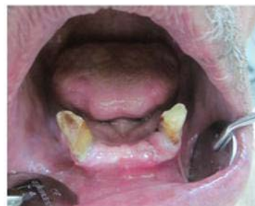
Figure 1 Maxillary edentulous ridge and a Mandibular ridge with two remaining canines.

Each patient retained two canines were endodontically treated, reshaped and shortened approximately to a level 3-4 mm above gingival margin to create space for placing high copy and artificial teeth [10]. Construction of the two metal copings followed by their cementation with temporary cement material ( Figure 2 ). A secondary impression for the maxillary arch was made and, mandibular full arch special tray (open tray) was constructed and fenestrated in the abutment areas so, it didn't touch the copings, a selective pressure impression technique was made, duplication of the mandibular master cast was done to make a secondary master cast for the thermo-elastic overdenture construction. Maxillo-mandibular jaw relation records were registered, Semi anatomic acrylic resin teeth of angle 25 were selected, arranged to achieve a balanced occlusion. Maxillary denture was processed from hard acrylic resin (vertex rapid simplified, vertex dental company, Holland).