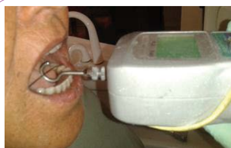
Figure 4 The mechanism of retention measurement with forcemeter in place.