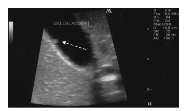
Figure 1. An echogenic non-mobile structure attached to the gallbladder wall: features suggestive of a polyp.

Furthermore, examination of the other systems did not disclose pathological findings. The patient's temperature was 37.2°C. Laboratory data other than amylasuria (1,030 IU/L; reference range: 0-500 IU/L) were within the reference limits. The ultrasonographic study showed a small well-defined, non-mobile echogenic structure of 4 mm in diameter attached to the wall of the gallbladder. The features of the echogenic structure were suggestive of a gallbladder polyp (Figure 1) but not of a gallstone. Therefore, the most likely diagnosis was a gallbladder polyp and a laparoscopic cholecystectomy was carried out.