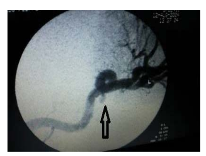
Figure 1. Coeliac axis angiogram showing pseudoaneurysm of splenic artery (arrow).

At surgery dense adhesions were encountered between the tail of pancreas /spleen with the fundus of stomach and also with left adrenal gland. Pancreatic duct was dilated with multiple linear clots inside the duct along with stones (Figure 2). Adherent sleeve was removed enbloc with