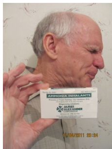
Figure 3: Reaction of disgust from inhalation of ammonia salts. Sensory avoidance, Turning of the head away from the irritant, Rapid blinking or forced lid closure, A lowered brow, Wrinkled nose (nose scrunch) (11) that increases airway resistance (Disgust).

The length of time for one complete blink from beginning descent of the lid to its return to the original, elevated position is 0.30-0.90 seconds. During that time, it completely obscures vision for 0.15 seconds and partly reduces visual field during the entire blink [11]. During normal blinking, people are unaware of this loss of vision, since the brain creatively fills in the missing segments. This creativity could lead to a victim's demise during a predatory attack. Fear decreases the blink rate in order to increase vision, focus, and concentration. This need for maximizing focus also causes slowing of the rapid scanning eye movements to slow pursuit.