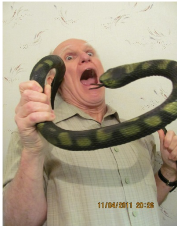
Figure 2: Reenactment of fearful emotion from the sighting of a snake. Focused attentiveness, elevation of lid and brow, opened mouth and nostrils (Fear).