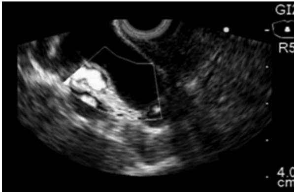
Figure 1. EUS linear image demonstrating common bile duct dilatation.

fentanyl and propofol. It was a procedure involving an obstructed biliary system, and a prophylactic antibiotic (ciprofloxacin 400 mg i.v.) was used, only in the beginning of the procedure.