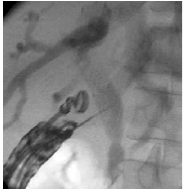
Figure 3. EUS guided cholangiography.

to pass the guidewire through the lesion to reach the duodenum as a “rendezvous” maneuver, without success.