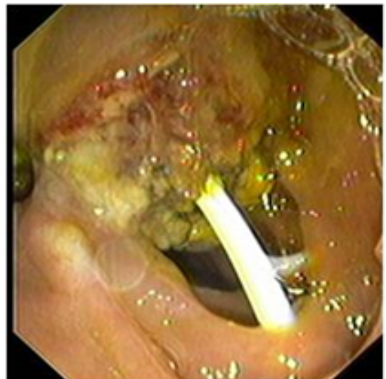
Figure 3. Biliary stent placed in the common bile duct after excision