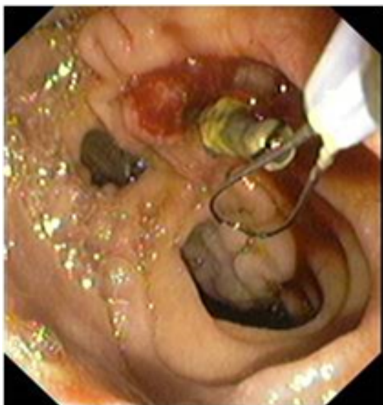
Figure 5. Stent removal after 3 months follow -up.

Endoscopic snare papillectomy was safely performed in all three patients. In this study temporary biliary stenting has been shown to be a sufficient procedure to prevent