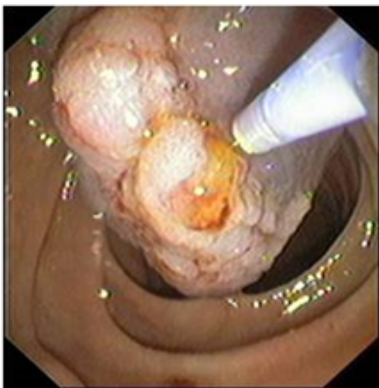
Figure 2. Submucosal injection before papillectomy.