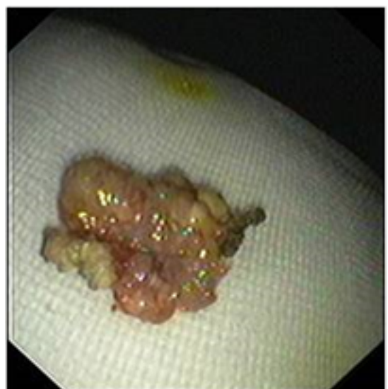
Figure 4. Resected specimen.