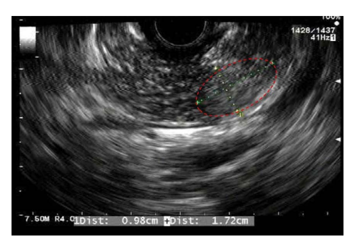
Figure 2. EUS confirming a 1.7 cm pNET in the head of pancreas (red circle), approximately 2 mm from the MPD (not seen in this image).