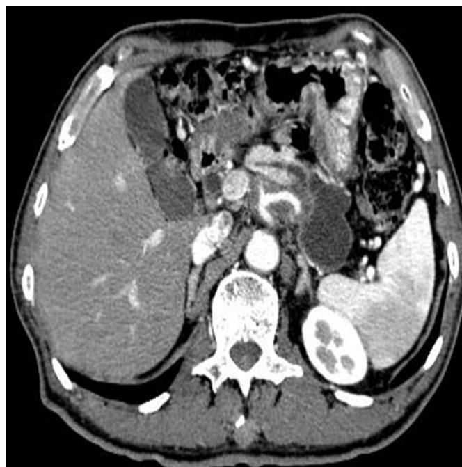
Figure 1. The enhanced CT shows that the pancreatic body tumor, including the cystic component, is involving the celiac axis.

DP-CAR is regarded as the extreme radical pancreatectomy for pancreatic body and tail cancer. However, its benefit for long-term survival is controversial, since very few cases have been published, and the outcome of consecutive series has never been reported. For selected locally advanced cases, successful R0 resection by DP-CAR was reported, mainly from a Japanese hospital [9, 10, 11, 12, 13, 14, 15]. They concluded that this procedure can increase resectability