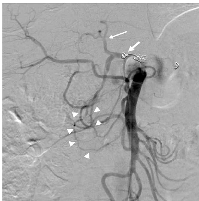
Figure 2. Superior mesenteric arteriogram after embolization of the CHA by coils (thick arrow) shows good visualization of the left hepatic artery (thin arrow) via the obvious pancreatic arcade (arrow heads).