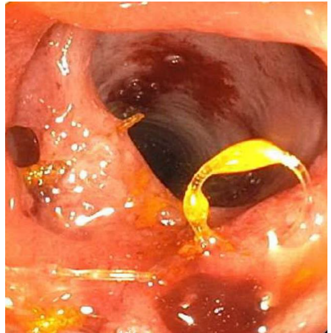
Figure 4. Stent Removed