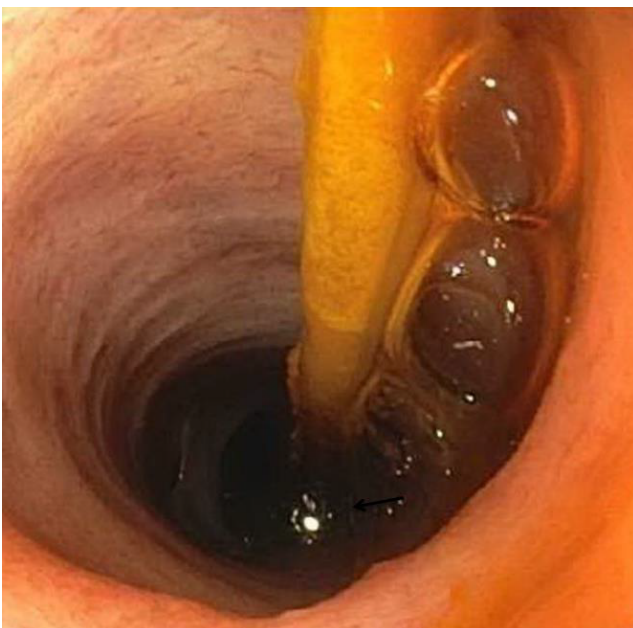
Figure 3. Migrated stent in bile duct