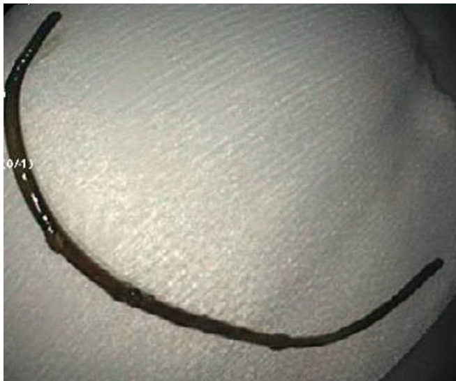
Figure 2. Stent removed