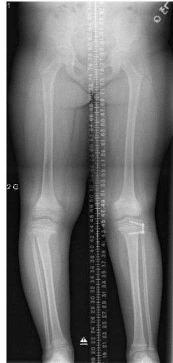
Figure 3 Follow-up standing AP radiograph demonstrating correction of mechanical axis on the left with new onset tibial physeal changes and varus malalignment of the right tibia.

However, it was now obvious that she had developed a new deformity of the contralateral right leg. In addition, her BMI had increased in the interim, from 25.48 kg/m 2 initially, to 28.19 kg/m 2 upon return presentation. Standing radiographs demonstrated correction of the left limb deformity. However, there was the appearance of new changes of the right medial proximal tibial physis and angular deformity consistent with Blount's Disease in a limb that had been uninvolved one year previously ( Figure 3 ). In light of the uncomplicated correction of the left limb deformity, and the new onset right limb deformity, removal of the left plate and screw device is planned simultaneously with a similar growth modulating procedure of the right proximal tibia.