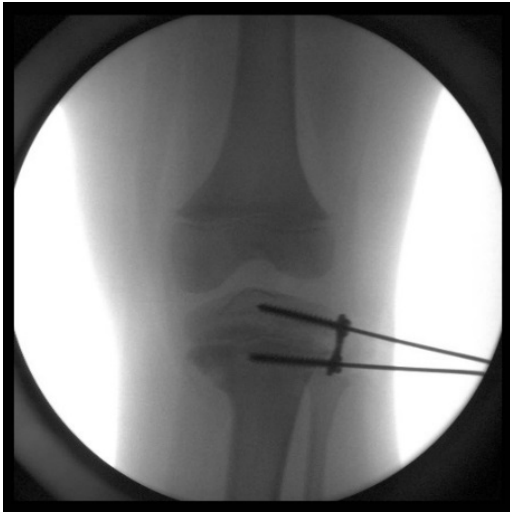
Figure 2 Intraoperative fluoroscopy image of screw/plate construct for hemiepiphysodesis procedure.

However, it was now obvious that she had developed a new deformity of the contralateral right leg. In addition, her BMI had increased in the interim, from 25.48 kg/m 2 initially, to 28.19 kg/m 2 upon return presentation. Standing radiographs demonstrated correction of the left limb deformity. However, there was the appearance of new changes of the right medial proximal tibial physis and angular deformity consistent with Blount's Disease in a limb that had been uninvolved one year previously ( Figure 3 ). In light of the uncomplicated correction of the left limb deformity, and the new onset right limb deformity, removal of the left plate and screw device is planned simultaneously with a similar growth modulating procedure of the right proximal tibia.