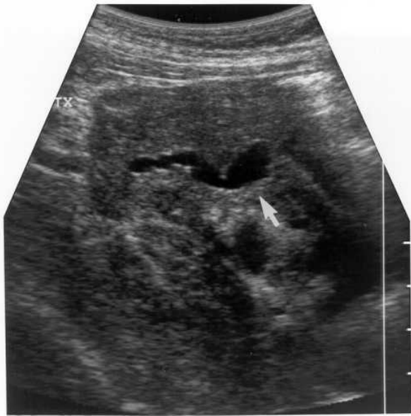
Figure 1. Ultrasound evaluation showed the pancreas transplanted in the right iliac fossa. A tubular structure was identified within the transplanted pancreas, which likely represented a dilated pancreatic duct. This structure measured 10.3 mm in transverse dimension.

pressure. Sphincter electromyography (EMG) is obtained by surface electrodes, wire electrodes, or needle electrodes placed in the perianal area. Perineal EMG is recorded during filling and voiding phase of the study. Uroflow studies are obtained as free flow rates and post-void residuals are examined after each evaluation. All urodynamic studies are performed in duplicate and the findings are averaged to give the final parameters. Fluoroscopy control is performed during the filling and voiding phase of the study.