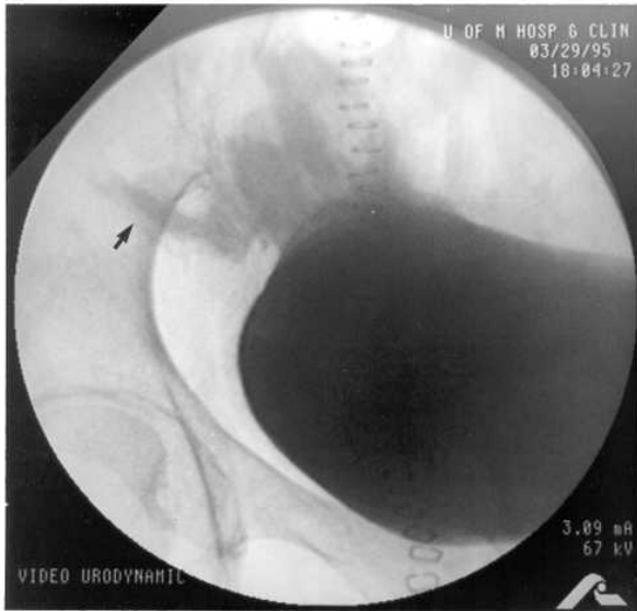
Figure 2. During the video-urodynamics, the patient was on supine position and monitored fluoroscopically. The bladder was filled with dilute contrast. Fluoroscopic control revealed a smooth walled bladder during the filling phase with a closed bladder neck. The patient experienced some reflux of urine into the duodenum segment and into the pancreatic duct during the height of the filling phase and especially during the voiding phase.

Pancreas biopsy showed fibrosis without rejection. This patient requires insulin.