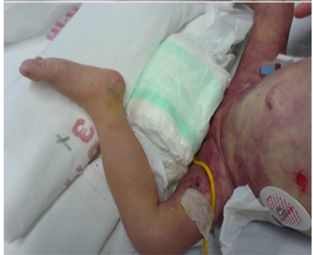
Figure 2: Livedo reticularis before and after limb milking.