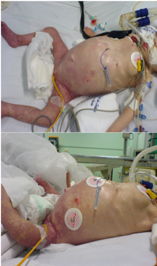
Figure 1: Abdominal distension with chest volume restriction top and side view.