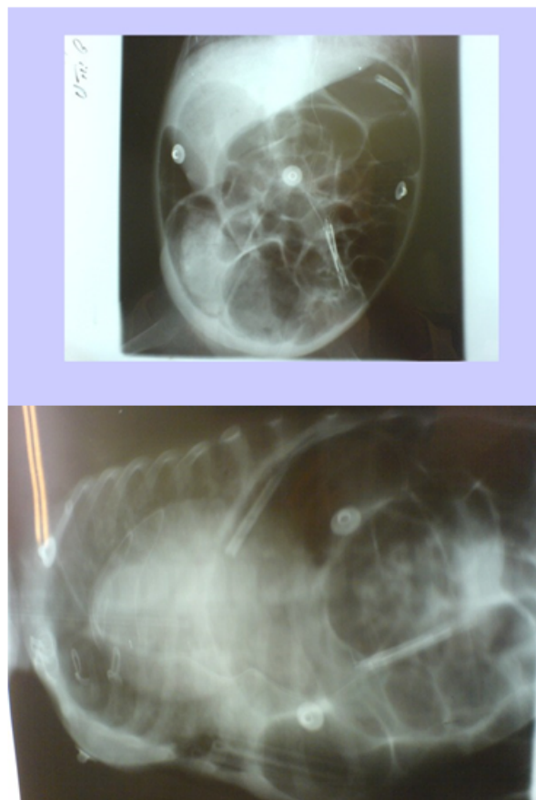
Figure 3: Abdominal radiograph with distended bowel loops (anterior posterior view and in right lateral decubitus).

She also presented metabolic and respiratory acidosis, anuria, with increased urea and potassium, acute renal failure need to increase ventilator pressures and doses of vasoactive amines, characterizing a diagnostic of MODS. On this occasion, IAP was measured at 29 mmHg. The echocardiogram showed a large thrombus in the left ventricle ( Figure 4 ). The child then underwent exploratory laparotomy eight hours after the onset of MODS, which revealed colon necrosis and small bowel distension. In the Trans operative period, she had a cardiorespiratory arrest and progressed to death.