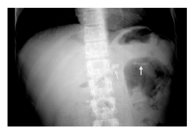
Figure 1. An X-ray of the abdomen showing calcifications in the pancreas.

35-65 mg/dL), LDL cholesterol 100 mg/dL (reference range: 90-150 mg/dL), VLDL cholesterol of 13 mg/dL (reference range: 0-39 mg/dL), and triglycerides 70 mg/dL (reference range: 50-190 mg/dL). ECG and echocardiography were normal. He had severe bilateral distal symmetrical polyneuropathy on biothesiometry; vibration perception threshold was 50 V at both ankle joints (reference range: 0-15 V). He also had proliferative retinopathy with traction retinal detachment in both eyes, but no nephropathy. His ankle brachial index was 0.75 in the right leg and 1.06 in the left leg 0.90 - 1.20) (reference value: showing impaired blood flow in the right lower limb. An X-ray of the abdomen showed pancreatic calcifications (Figure 1). An angiogram of the lower limbs showed severe peripheral vessel predominantly which disease was infrapopliteal (Figure 2). He underwent angioplasty for the stenosis of the right infrapoplitical vessels, followed by amputation of the right big toe. He was started on aspirin 75 mg, clopidogrel 75 mg and cilastazole 100 mg. With culture-specific antibiotics and proper wound dressing, the stump started to heal and the patient was discharged.