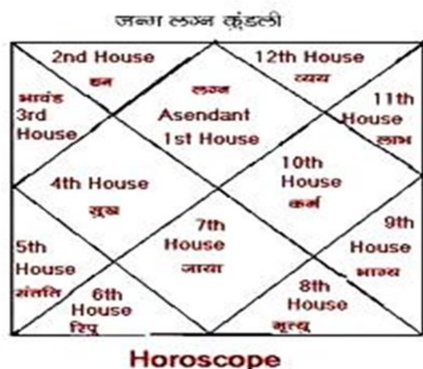
Table 1: Distribution of the ruling planets for different Zodiac signs.