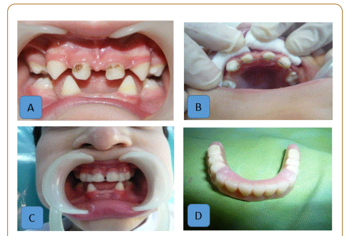
Figure 3 A: Conical forms of the teeth along with Oligodontia. B: Reshaping of mandibular canines as abutments and composite restoration for maxillary teeth. C: Wax up of the canines as abutments. D: Over denture made for the mandible.