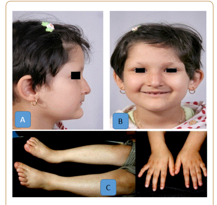
Figure 2 A, B: Lack of Eye lashes and eye brows, flattened nose bridge and hypotrichosis. C: Malformed fingers and hyper pigmentation in legs along with dry skin and nails.