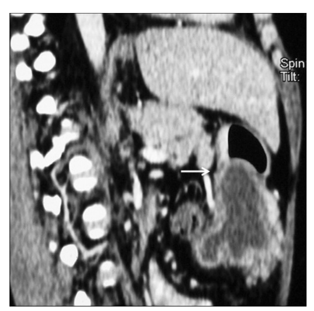
Figure 1. Contrast-enhanced CT (sagittal multiplanar reconstruction) of the abdomen shows a hypodense cystic lesion indenting the stomach wall (arrow). Finger-like projections are seen along the inferior aspect of the cyst.

had a normal mucosal lining with no communication to the stomach. Histology confirmed a duplication cyst with pancreatic tissue on the serosal surface of the cyst.