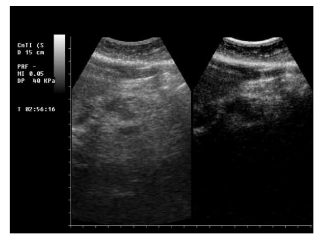
Videoclip of Movie 1

Two days later, due to the persistence of pain and an increased plasma concentration of C-reactive protein (16.4 mg/dL, reference range: 0-0.8 mg/dL), but without any physical signs of deterioration, an EEUS was carried out.