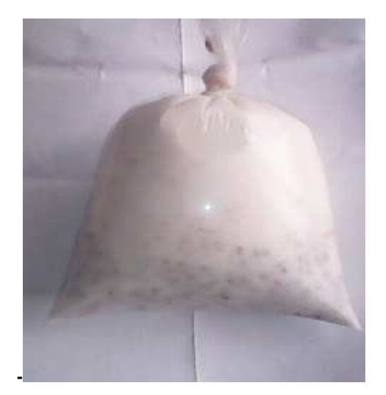
Fig. 1. A deger sample measuring about 250 ml

Deger samples were purchased from nine (9) different sources (seller/producers) in Tamale Metropolis and labeled A to I. Three (3) samples measuring about 250 ml each were obtained from each source and kept under ice and transported to Spanish Laboratory of University for Development Studies, Nyankpala Campus for analysis.