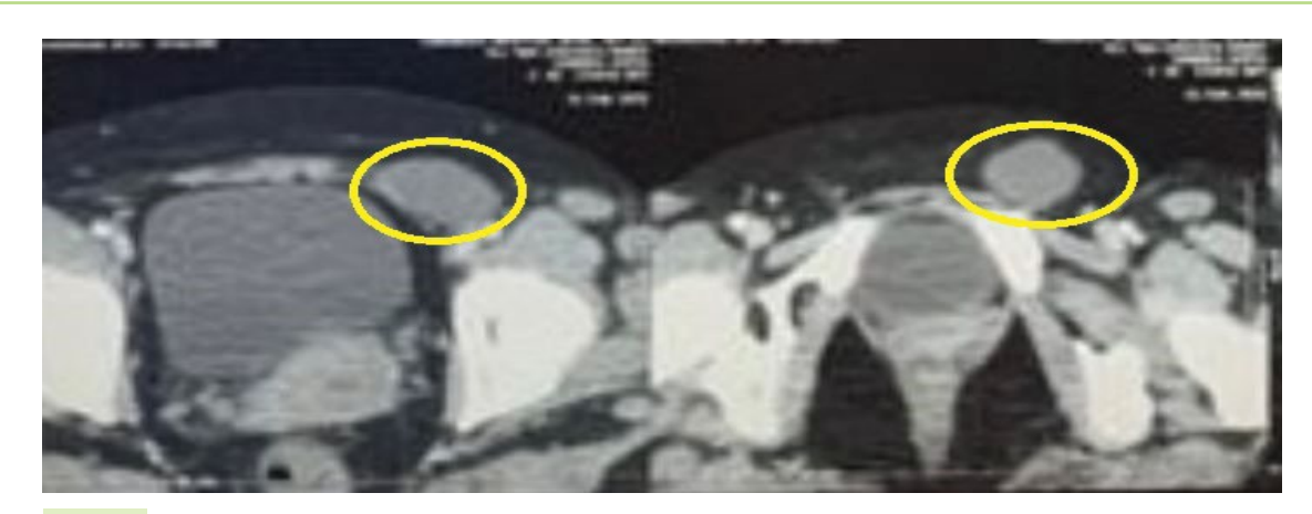
Figure 1 Axial section of computed axial tomography showing hydrocele in canal of nuck (Highlighted in circle).

Surgical treatment involving excision of cyst and repair of the defect remains the standard of care, the preservation or ligation of round ligament is variable. Open excision has been more popular, however, few authors have reported laparoscopic