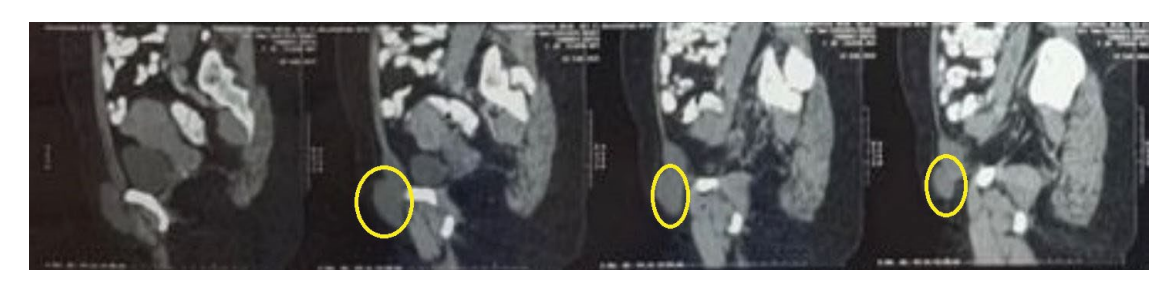
Figure 2 Sagital section of computed axial tomography showing hydrocele in canal of nuck (Highlighted in circle).