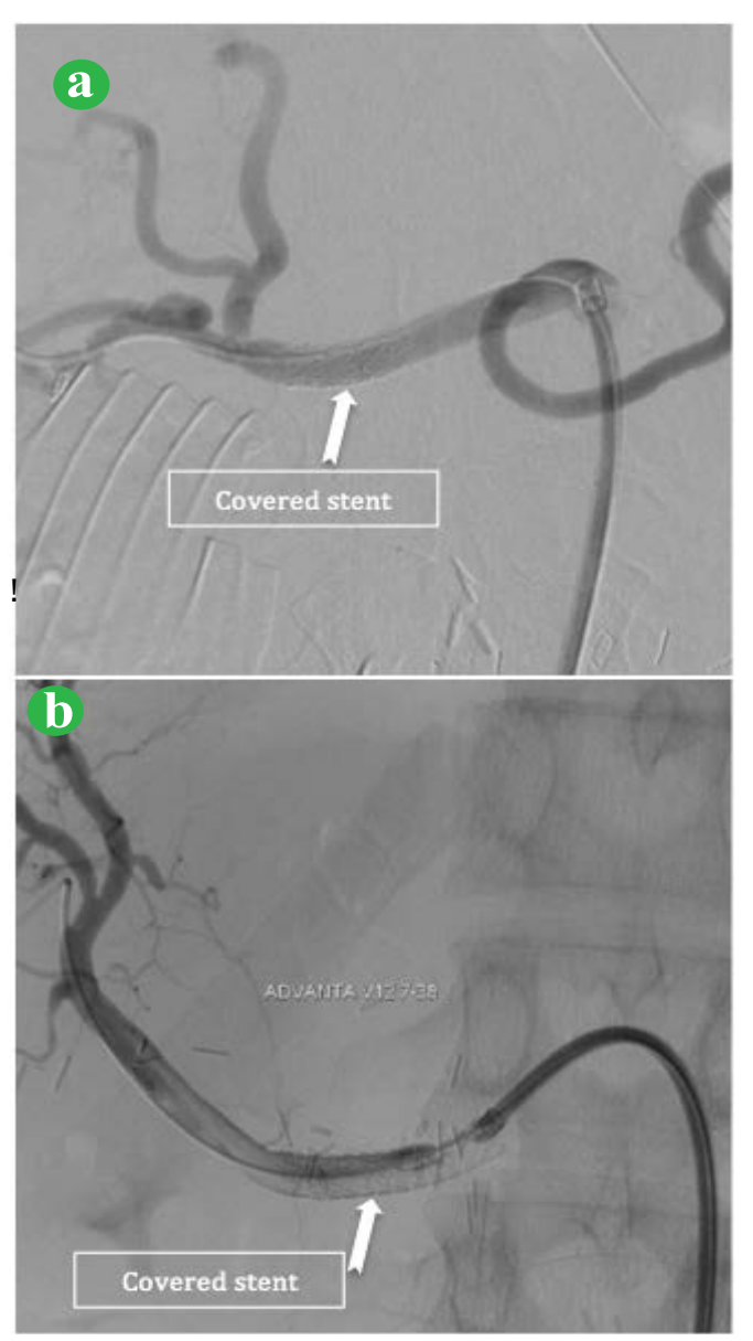
Figure 2. Stent covering the stump A and B: Covered stent-graft in the common hepatic artery.

of the ligated splenic artery to not expose the patient to another bleeding.