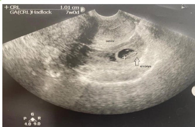
Figure 1 Transvaginal ultrasound image of the gestational sac with yolk sac and embryo located posterior to the cervix. Crown-rump length (CRL) is consistent with 7 weeks' gestation.

Based on the initial ultrasonography, we initially assumed that the patient had a left tubal ectopic pregnancy with a 7-week-old embryo. Laparoscopy was carried out because the patient had a