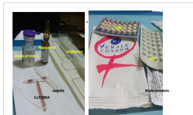
Figure 1 Available LARC* and Non-LARC in ESUTH: 2011-2015 LARC* Long Acting-Reversible Contraceptive methods

One thousand seven hundred and thirty seven (1737) new clients accepted the available family planning methods in ESUTH, Enugu during the study period. A total of 1567(90.21%) accepted LARC while 170(9.79%) only accepted non-LARC methods, thus giving a very high uptake rate for LARC of 90.21%. Table 1 showed majority of the clients were 30-39 years of age 1121(64.54%) while less than 20 years were 0.06% only. Six hundred and ninety (690) of the new acceptors had