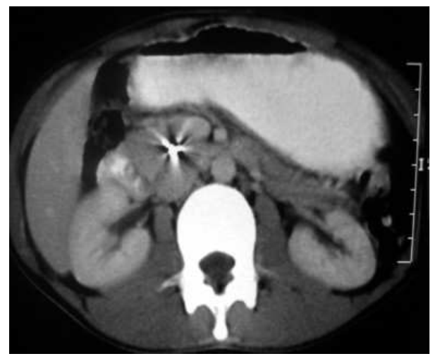
Figure 2. CECT showing radio-opaque foreign body in pancreatic head.