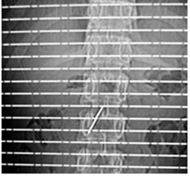
Figure 1. CT scanogram showing radio-opaque shadow suggesting needle.

revealed radio-opaque foreign body at the level of 2<sup>nd</sup> lumbar vertebra simulating a needle (Figure 1). Contrast enhanced computerized tomography scan showed a thin radio opaque (2,300 HU) linear structure of 6.4 cm embedded within head of pancreas (Figure 2).Patient was planned for laparotomy .Duodenum was kocherized and lesser sac opened. Pancreatic head was firm in consistency, needle could not be palpated, intraoperative sonography was used to localize the foreign body in the head of pancreas. Local resection of needle bearing part of head pancreas preserving duodenum Roux-en-Y pancreaticojejunostomy was done (Figures 3 and 4). Postoperative period was uneventful and patient was discharged on day 7 on satisfactory condition.