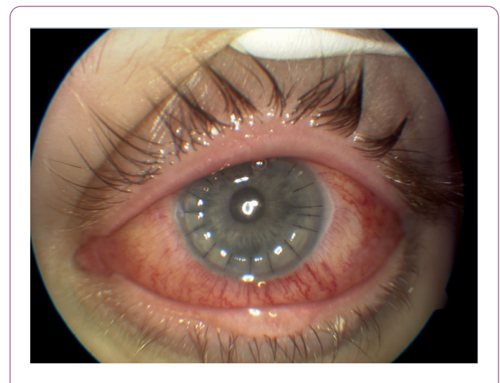
Figure 3: Clear corneal transplant and anterior chamber by the female patient 3 months after the keratoplasty à chaud.