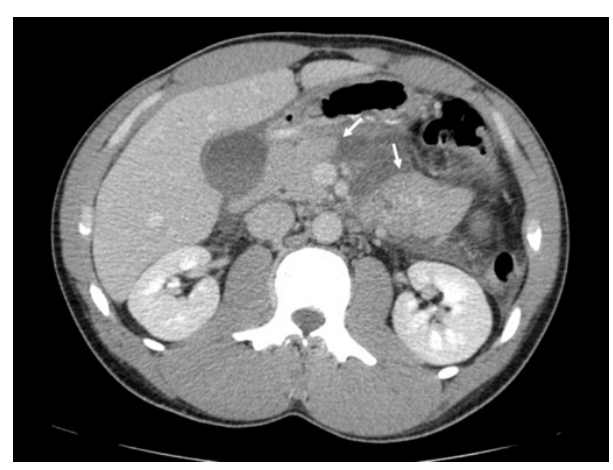
Figure 1. Contrast-enhanced CT scan of abdomen and pelvis demonstrating transection at the junction of the pancreatic neck and body (arrows).

Ten days later, the patient returned to the emergency room complaining of mild abdominal pain, vomiting, and diarrhea for 24 hours. The remaining drain had been removed in the office several days prior. Work-up revealed significant leukocytosis (WBC 41,600 µL<sup>-1</sup>) and multiple peripancreatic and subphrenic fluid collections on repeat computed tomography. The patient was treated with percutaneous drainage and has recovered well at two months follow-up.