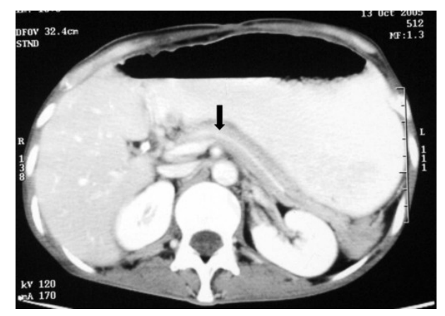
Figure 2. CECT performed prior to reconstruction shows a normal pancreas. The pancreatic catheter (arrow) can be seen in situ. Note the biliary system is decompressed.

The surgical management of combined pancreaticoduodenal injuries is complex and the options vary from repair and external drainage to pancreaticoduodenectomy [1, 12, 16]. Pancreaticoduodenectomy is reserved for patients with uncontrollable bleeding from the pancreatic head, proximal pancreatic duct or