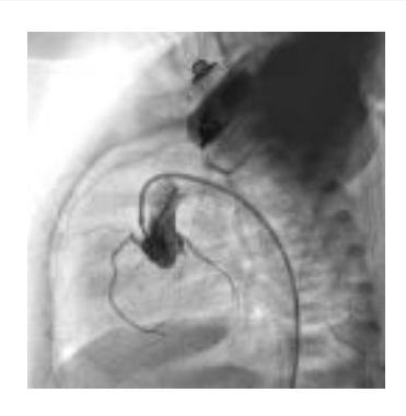
Figure 2: Coronary angiography was noted normally at the third day of the hospitalization.

treatment. At eleventh day after delivery the patient exchanged absolutely with normal findings of ECG (Figure 3) and cardiac troponin (hs-cTnT).