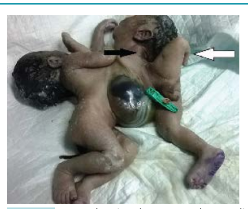
Figure 3 Image showing the structural anomalies in one of the newborns. Black arrow indicates the absent upper limb and the white arrow points to the hypoplastic left lower limb.

A decision for an emergency Lower segment caesarean section (LSCS) was taken and the patient prepped after explaining the situation and obtaining consent.