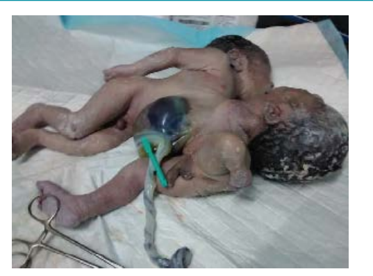
Figure 2 Image immediately after delivery with the cord clamped and cut.