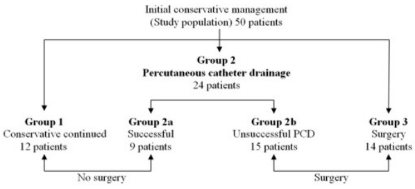
Figure 1. Schematic representation of the management of the 50 patients with severe acute pancreatitis.

the supportive care, they were divided into three main groups: those responding to intensive care, those undergoing image-guided percutaneous intervention and those undergoing surgical intervention following failure of the non-surgical treatment as per the indications listed above. Out of 50 patients, 12 (24.0%) were managed with supportive intensive care management (Group 1) while 24 (48.0%) underwent image-guided percutaneous drainage (Group 2). Of the latter, 9 patients (37.5%) recovered and did not require surgery (Group 2a) while 15 (62.5%) were operated on (Group 2b). In 14 patients (28.0%), surgery was performed after the failure of conservative management (Group 3) (Figure 1).